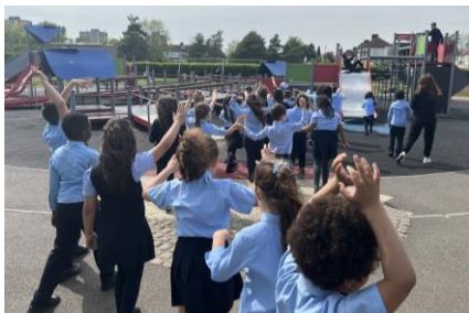
Above is a picture of Dahl class who were the attendance winners of the week last week!

Congratulations to Bird class who won the attendance award this week. They will be going to the park on Friday to celebrate!