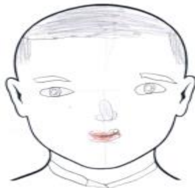
My eyebrows are curved , my eyes are oval , my nose is triangular and my mouth is curved .